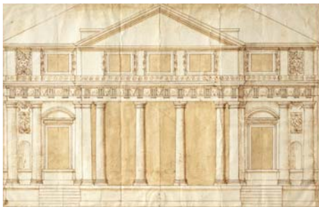
Andrea Palladio, Design for the Villa Repeta at Campiglia, ca. 1550.

The exhibition begins with five drawings from Palladio’s early career and his intensive study of the architecture of antiquity. His sketch of the warehouses of Trajan at Ostia shares many design elements found in his later Basilica in Vicenza. A drawing of the antique bases of columns in the Lateran Basilica shows that