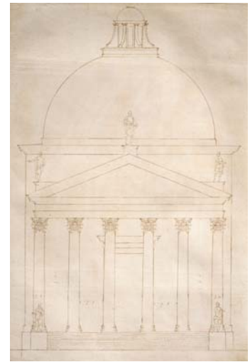
Andrea Palladio, Facade design for the church of Il Redentore, Venice . RIBA Library Drawings and Archives Collections.

The exhibition also presents drawings that demonstrate Palladio's creative process. On view are rough sketches, with unfinished areas and traces of earlier ideas, for the Villa Mocenigo and the reconstruction of the Mausoleum of Augustus. Juxtaposed with these are perfectly executed drawings made for some of Palladio's patrons, including an elevation drawing of a villa that demonstrates the effect of sunlight on the building. Several of the architectural drawings are complemented by modern bas-reliefs that express in three dimensions what the drawings represent.