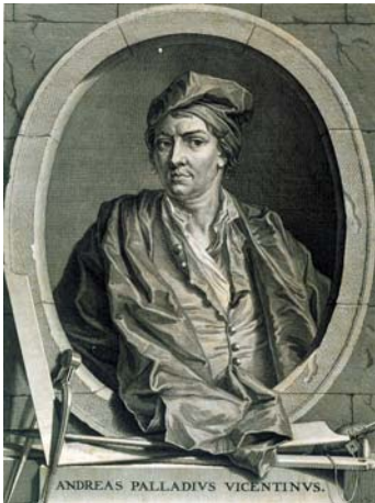
Sebastiano Ricci (1659–1734), Conjectural portrait of Andrea Palladio, 1715.

New York, NY, February 15, 2010 —Andrea Palladio (1508–1580) is considered among the most significant and influential architects in the Western world. His clean, elegant interpretation of the architecture of classical antiquity was to spread throughout Europe and North America, and his finished buildings, drawings, and writings have become cultural touchstones.